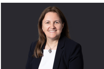
Zo Hoida Partner