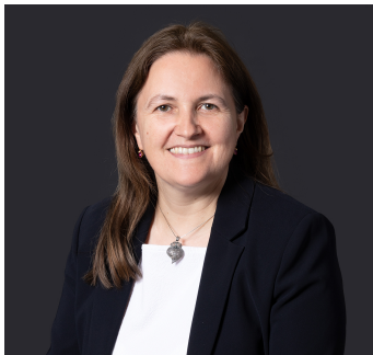
Zo Hoida Partner

Specialises in development work particularly in the government sector including high profile regeneration projects for local and central government, and with Chinese investors and developers.